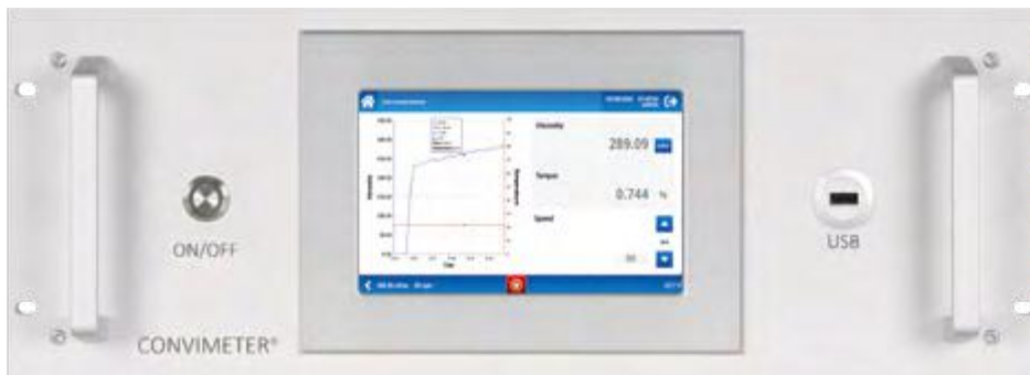
Control unit with integrated touch screen