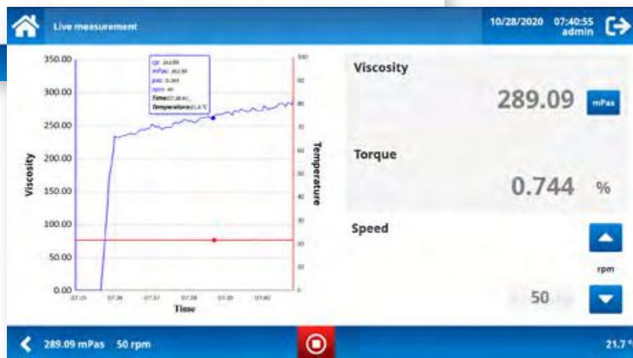
User interface – Live measurement