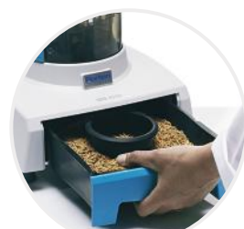
3.125% in the cup