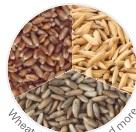
Wheat, Barley, Rice and more