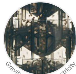
Gravity driven, no electricity