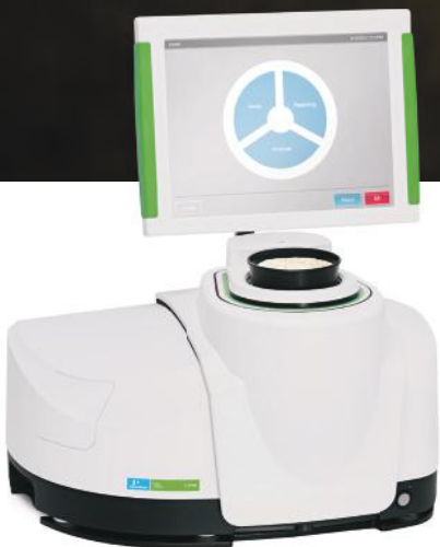
FT 9700 Full-Wavelength-Range FT-NIR Spectrometer