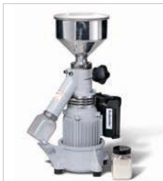
Break Mill SM 3